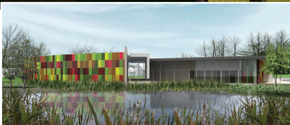
The design for the $26-million history museum to be built at Doon Heritage Crossroads includes a pool of water symbolizing the Grand River which flows nearby. The museum is scheduled to open in 2012.

He steps a bit to the right. Then stops suddenly and says, “The museum will be